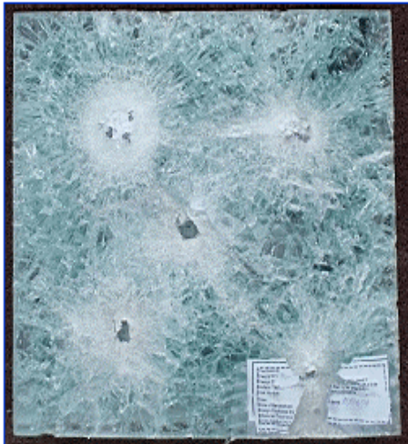
Sample 11 Post Test Impact Side

Sample 11: MWGF-NIJI3IA-UL3-ENBR4 - D.O.M. November 14, 2019 - CFR NIJ IIIA EN BR4 UL Level 3 - NIJ III-A Part 1 - 11.97 x 11.97 x 1.303 in.