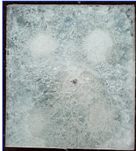
Sample 11 Post Test Rear Side